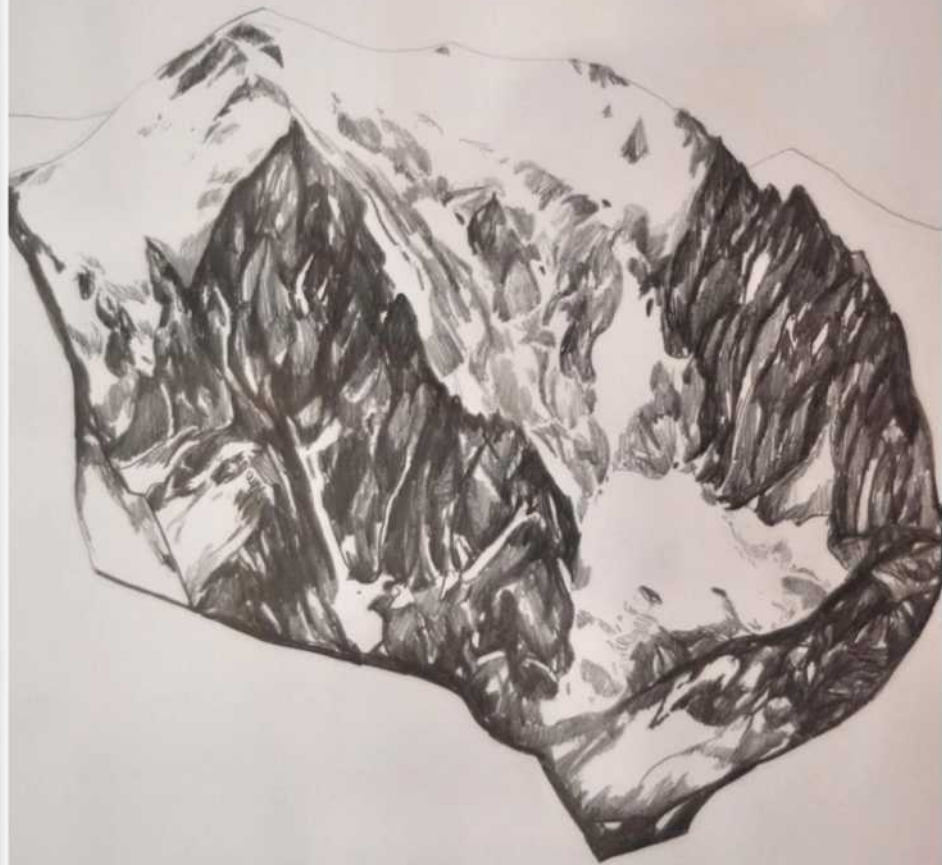
"Il Monte Bionico" Rough