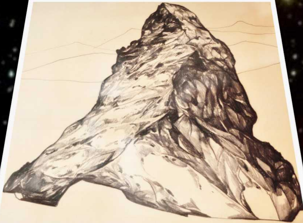
"Il Cervino" Rouch